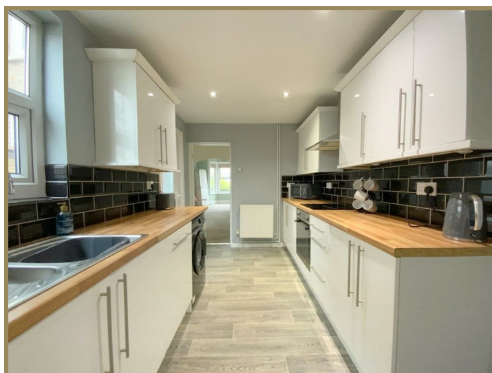
96 Mill Road, Cleethorpes, North East Lincolnshire, DN35 8JD £160,000